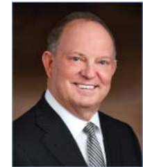
Senator Mike Hewitt